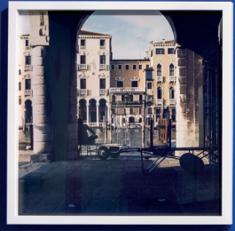
ARTIST'S NAME TITLE OF THE WORK MUSEUM NAME