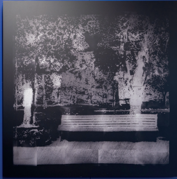
ARTIST'S NAME TITLE OF THE WORK MUSEUM NAME