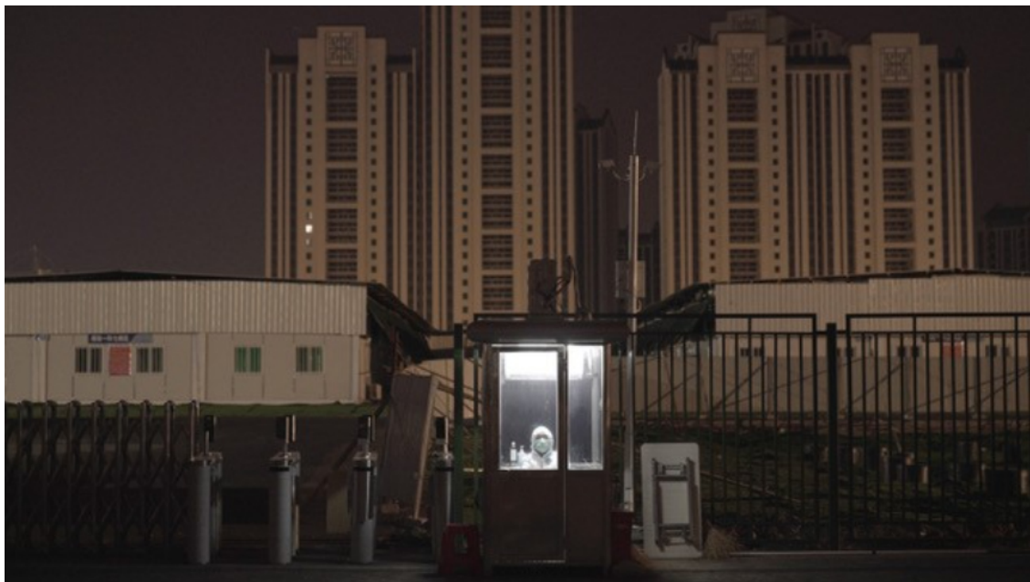
Image: © Wu Yue, Untitled from Wuhan Series, 2020 . Commissioned by the University of Salford Art Collection.

Ahead of joining the judging panel for the Sony World Photography Awards, University Curator Lindsay Taylor takes part in an online Q&A with the organisation. Visit the World Photo website to read the interview – which includes discussion on our approach to collecting as well as thoughts on the future of photography in contemporary art contexts.