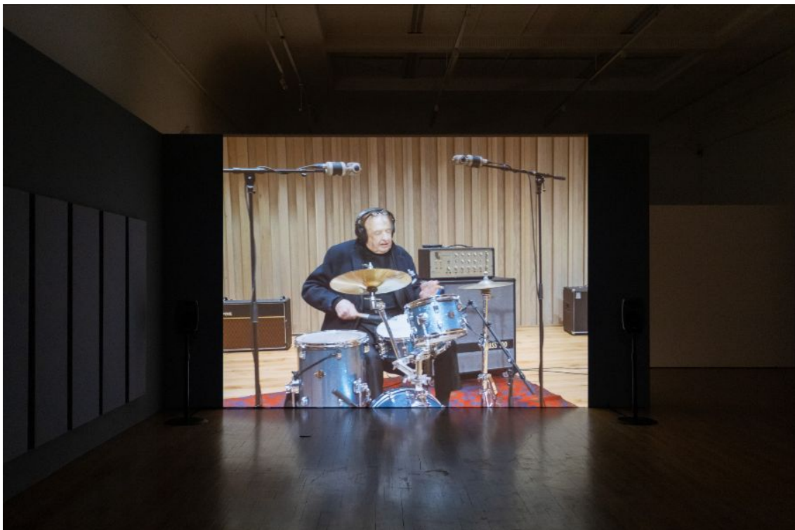
Open Music Archive Everything I Have Is Yours (2019), Digital video.