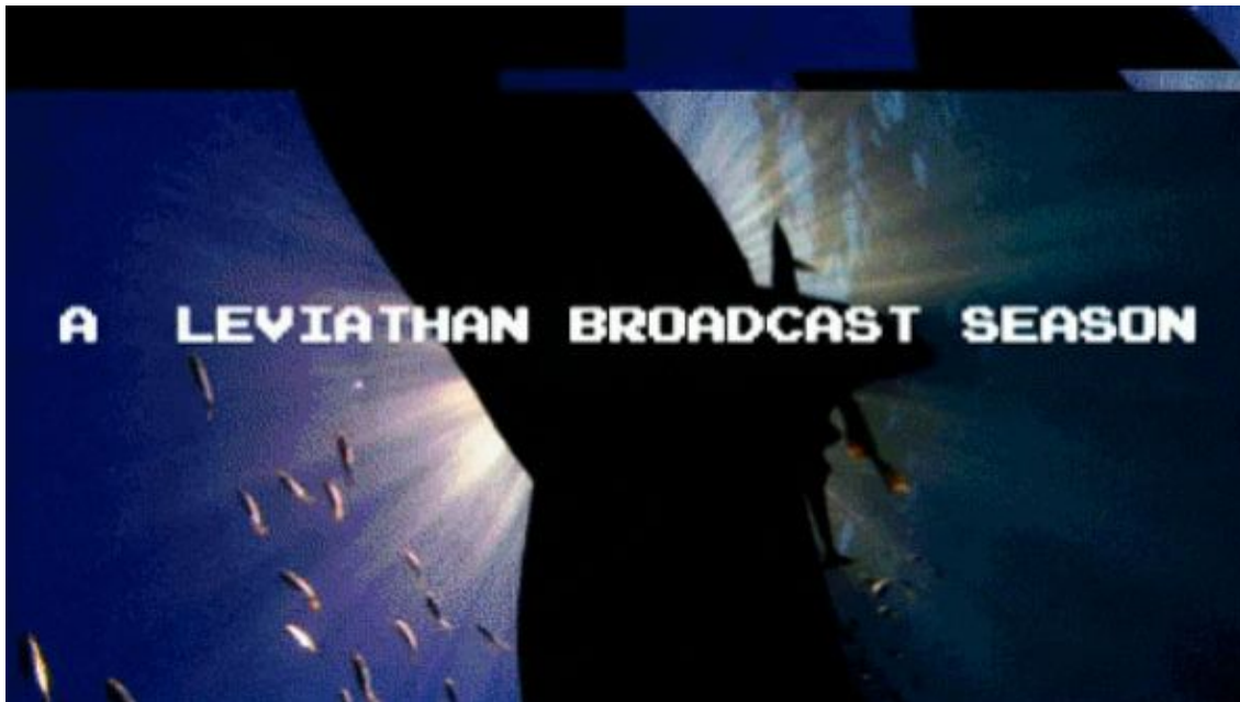
Leviathan Cycle broadcast season.

'The world was ending as it had been doing for millennia....'