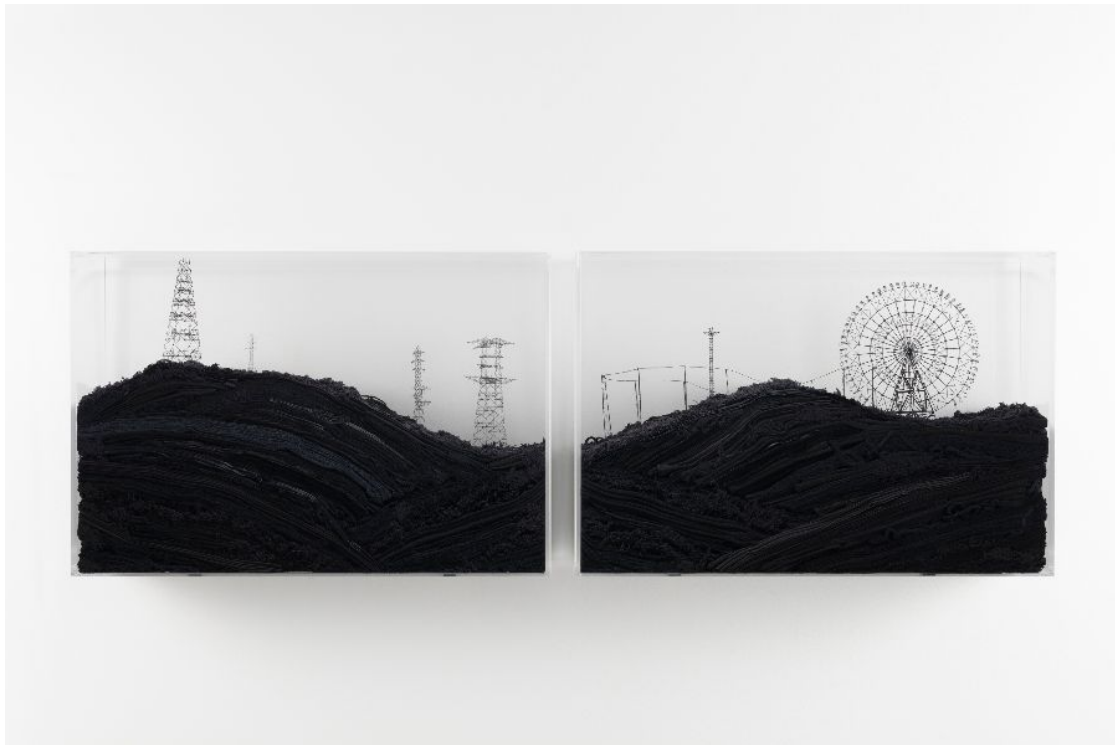
Takahiro Iwasaki, Out of Disorder (Section), 2017.

Our colleagues at Salford Museum and Art Gallery with the support of the Japan Foundation are offering 3 events linked to the Superlative Artistry of Japan exhibition: