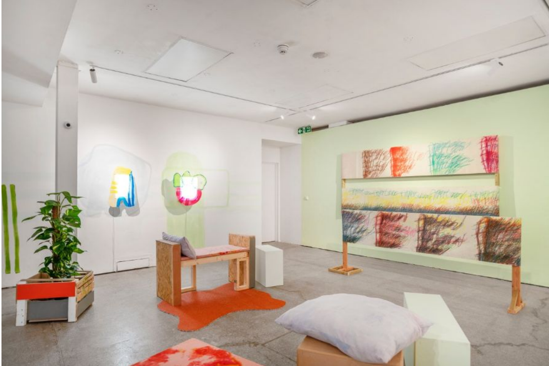
Thumbs Up , Castlefield Gallery.

The eagerly awaited Thumbs Up exhibition opened at the end of January to a packed-out crowd. Each of the artists were commissioned to make new work inspired by conversations and studio time with each other. Warm, bright and colourful the exhibition is full of energy and has plenty of physical and emotional space for reflection. Works by each of the artists will enter the University Art Collection at the end of the exhibition, however seeing them all together is must!