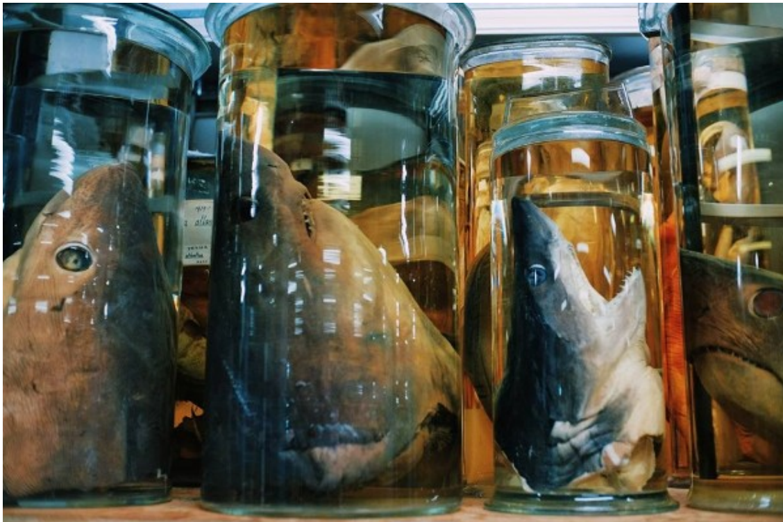
Shezad Dawood, Leviathan Cycle, Episode 1: Ben , production still, 2017, HD Video, 13' 30".