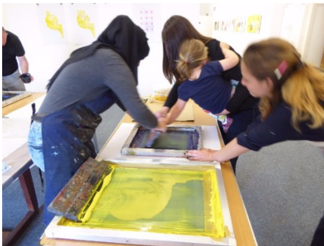
PRINT UnLtd. workshop at Salford Museum and Art Gallery.