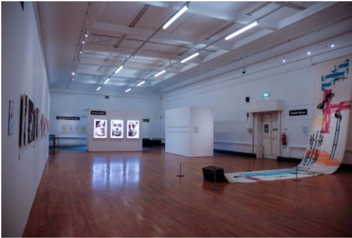
PRINT UnLtd. installation shot at Salford Museum and Art Gallery.

The final weeks to catch PRINT UnLtd. , an exhibition of new works by Manchester and Salford based artists, celebrating, challenging and questioning contemporary printmaking.