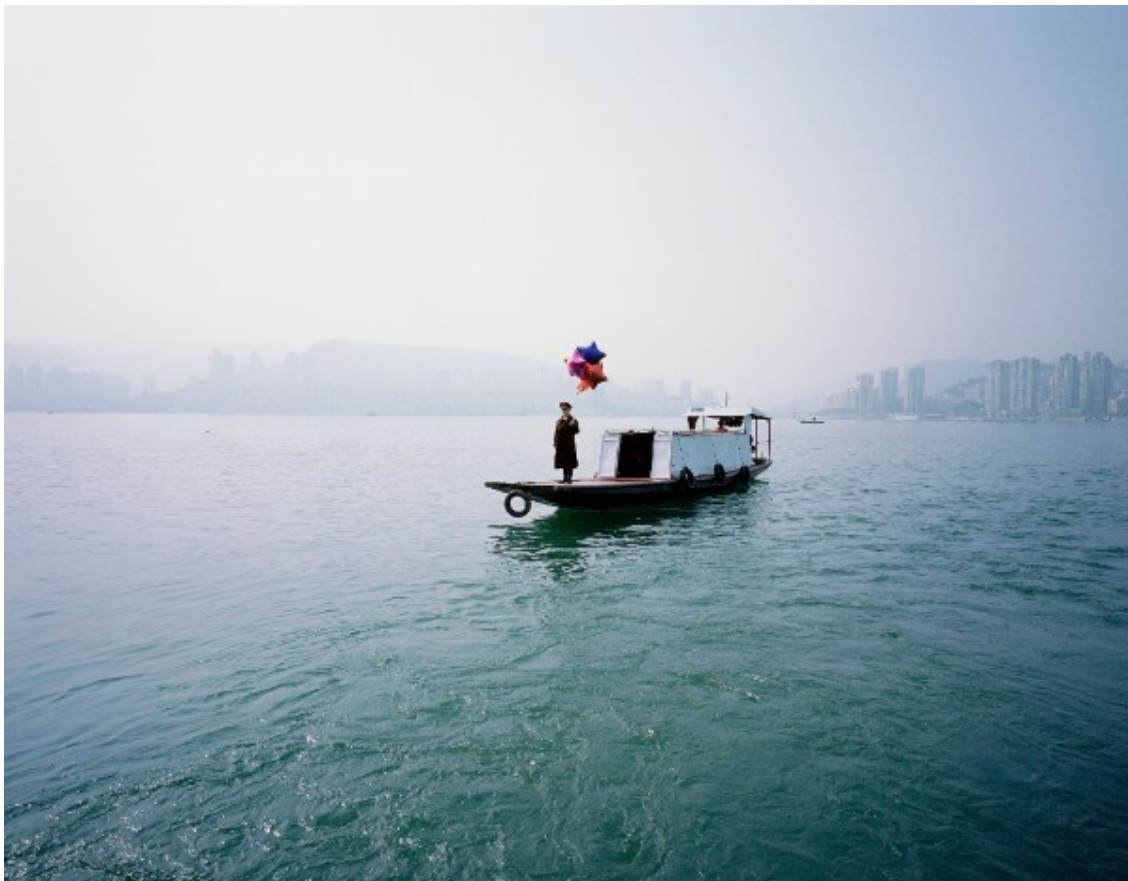
陈秋林 Chen Qiulin, 空的城 The Empty City No.1, 数码艺术微喷印刷 . Photograph 2012.