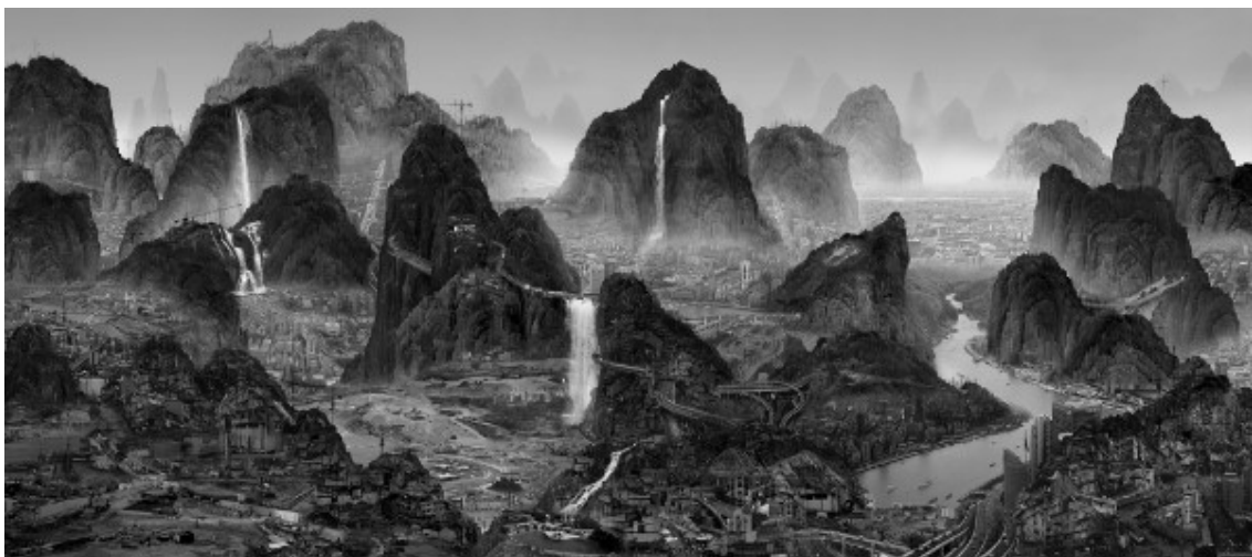
Yang Yongliang. The Night of Perpetual Day . 2014.