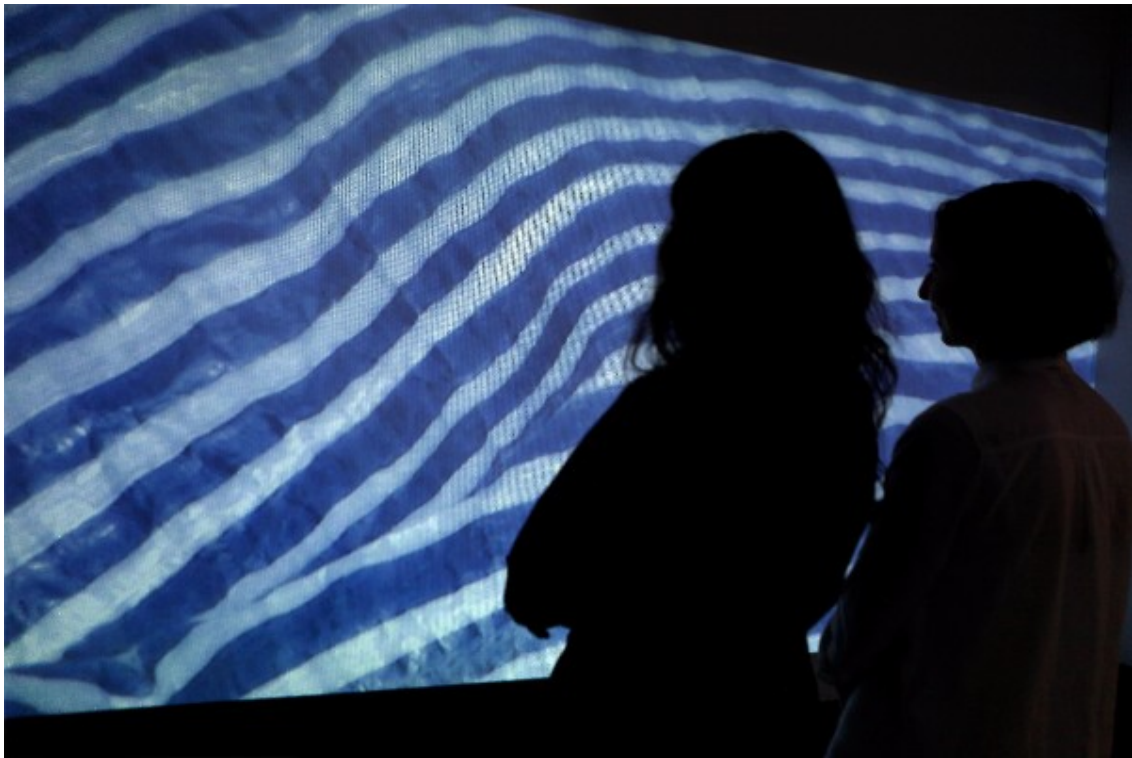
Ko Sin Tung, Redundant waves , 2017, HD single-channel colour video, acrylic on archival inkjet prints, trench covers, installation view.

From Ocean to Horizon is a group exhibition featuring established and emerging creative talents from Hong Kong, most of whom have previously never exhibited in the UK, presenting unique perspectives on living and working in present-day Hong Kong.