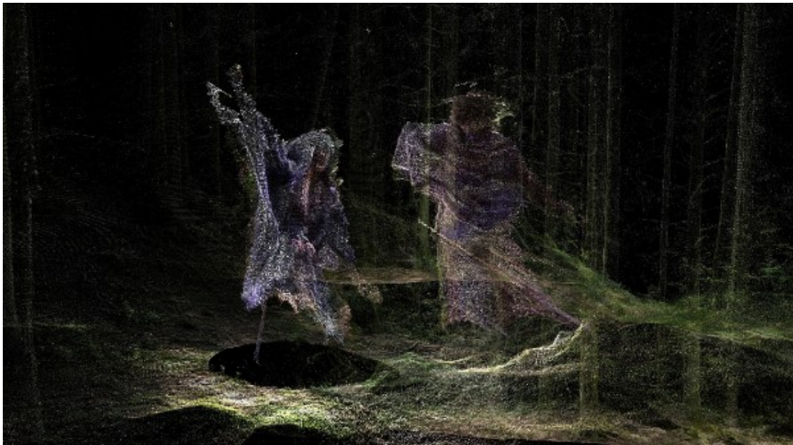
Liam Young, Where the City Can't See , 2016, still from film. Dichroic lidar print. Co-commissioned with Abandon Normal Devices.

Synthesis brings together 5 recent acquisitions from the University of Salford Art Collection and represents our three main collecting priorities: From the North , About the Digital and Chinese Contemporary Art .