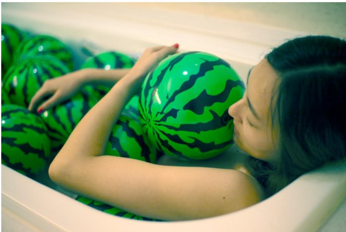
Cao Fei, Haze and Fog (production still) 2013.

Admission: Free, for bookings visit Eventbrite .