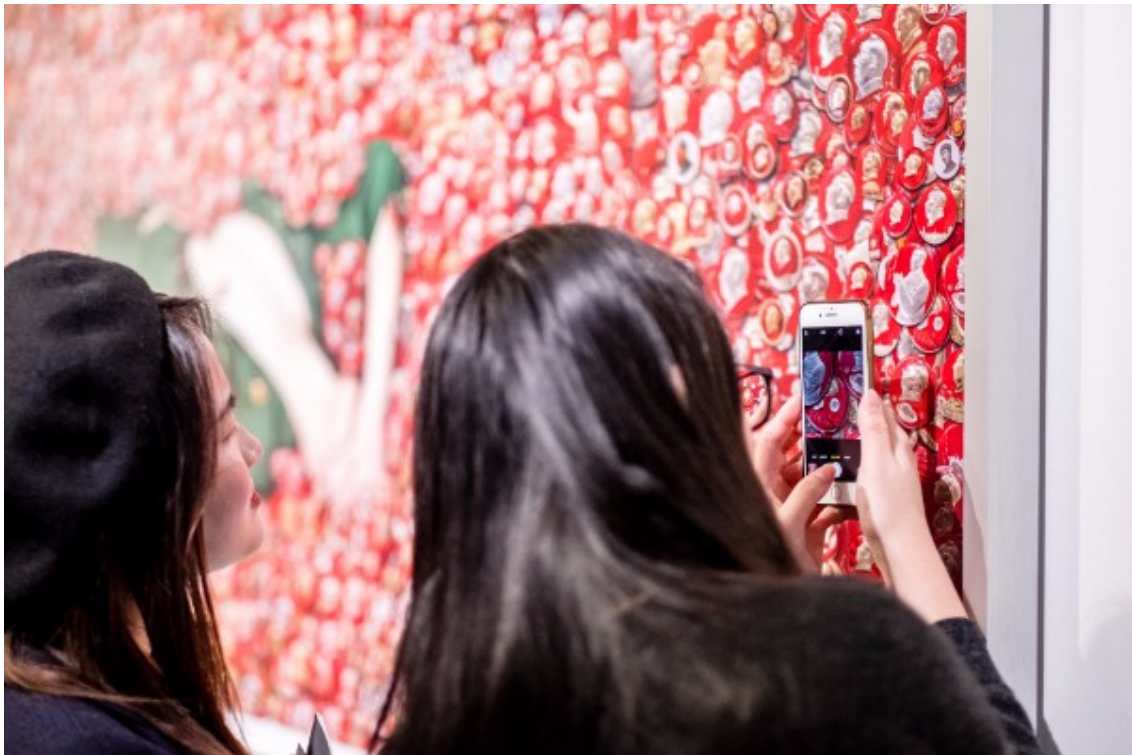
Tian Taiquan, Totem Recollection 3 . Installation shot at St. George's Hall, Liverpool.