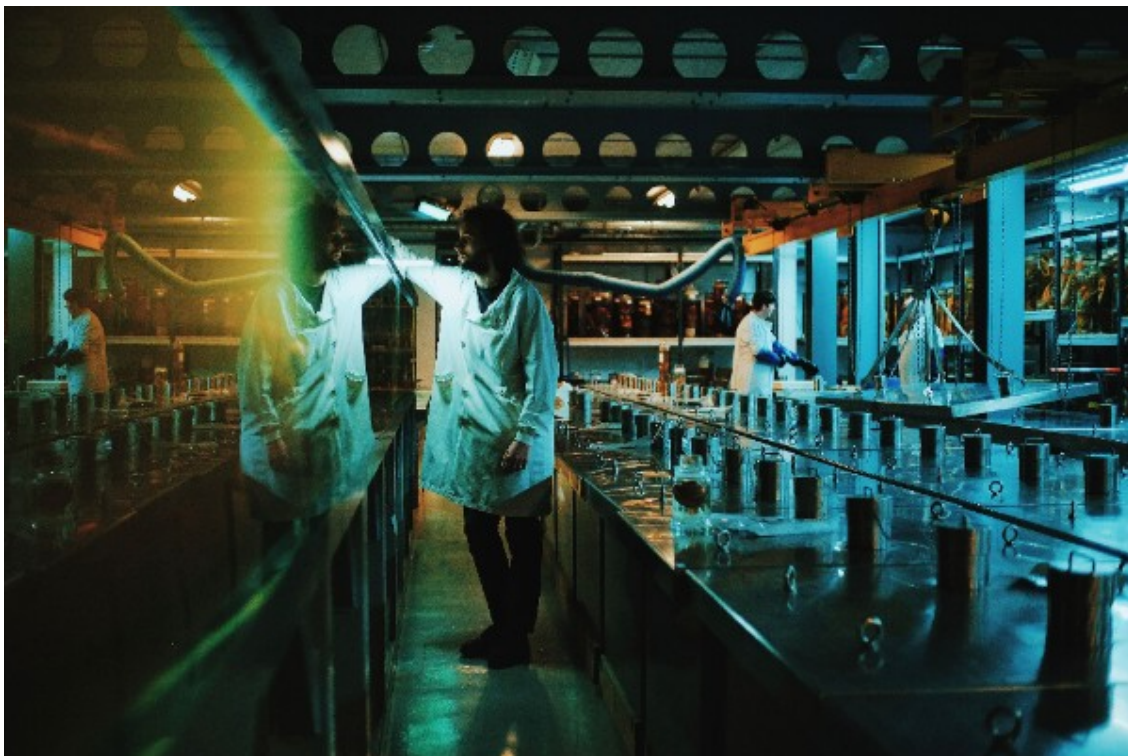
Shezad Dawood, Leviathan Cycle Episode 1: Ben , 2017, HD Video, 13'30" (production still).