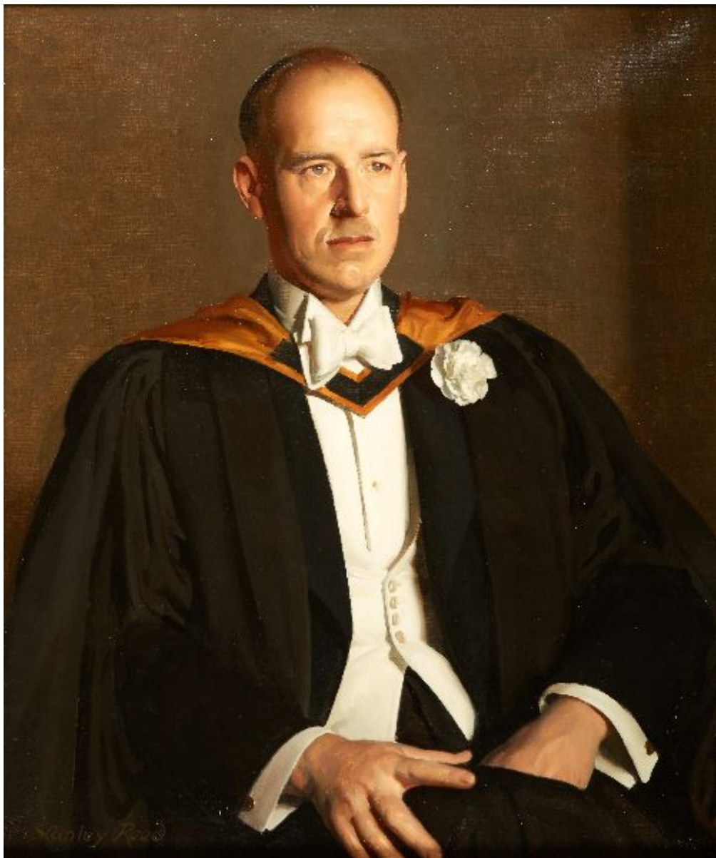
Stanley Reed, L.M. Angus-Butterworth Esq MA, 1950. Oil on canvas. © Stanley Reed.