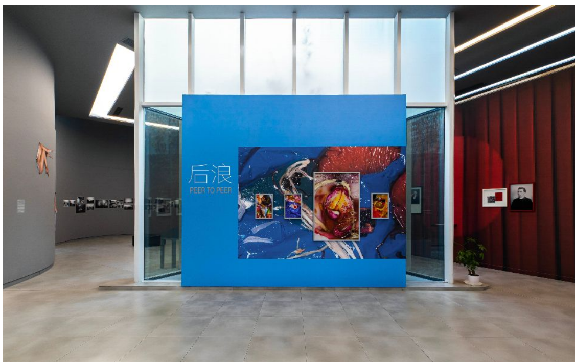
Peer to Peer at Shanghai Center for Photography. Installation Shot.