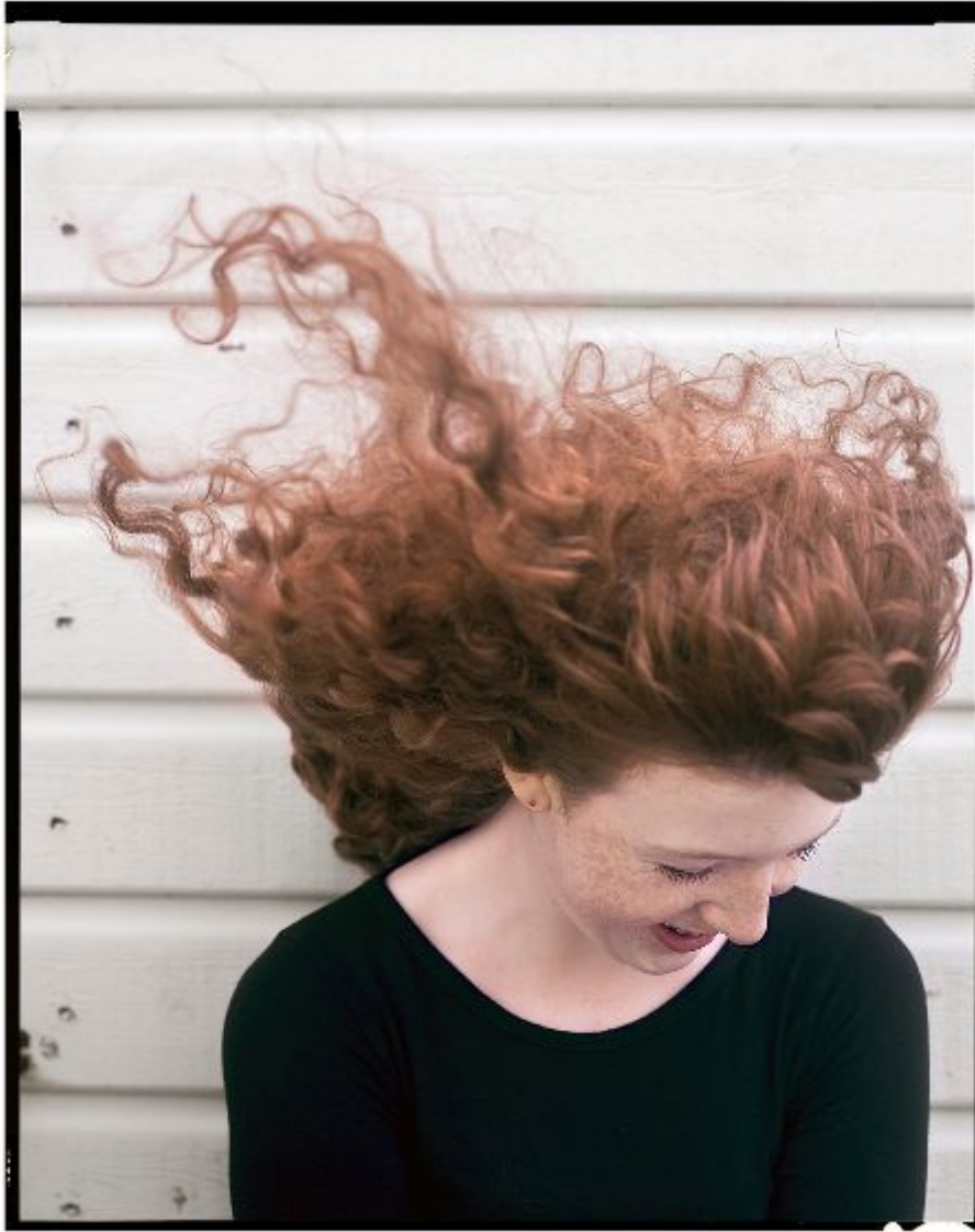
Craig Easton, Enya, Brae, Shetland . © Craig Easton, part of Sixteen . Supported by Arts Council England project grants. All rights reserved.

Following the SIXTEEN launch in our New Adelphi Exhibition Gallery in February 2019 the project has shown in 17 venues across UK, ranging from libraries, museums and galleries to international photography festivals. More than 250,000 visitors across Scotland, England, Northern Ireland and Wales have seen SIXTEEN – and the project is now heading to Glasgow and London.