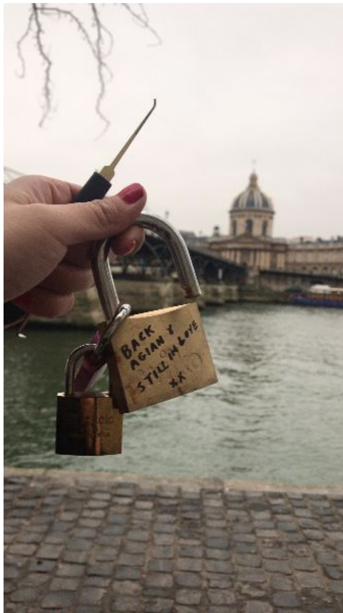
Miao Ying, Love's Labour's Lost , 2019. Video still.

Chinternet Ugly navigates the messy vitality of China's online realm, a space where artists can engage, play and debate. The exhibition features works by six leading new media artists and includes new work by Miao Ying, co-commissioned by CFCCA and University of Salford for the Art Collection.