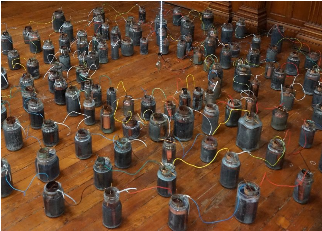
Hannah Leighton-Boyce, More energy than object, more force than form (detail).

Installation photograph at Glasgow Women's Library.