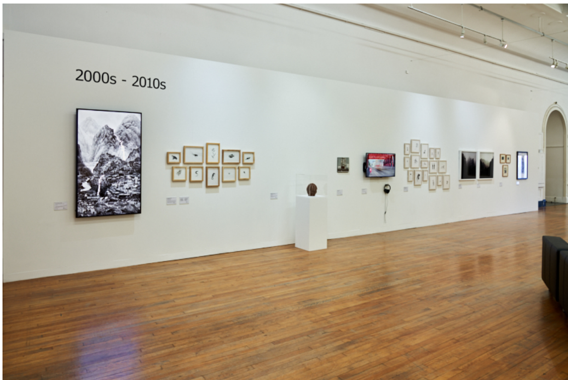
Acquired: a century of collecting , installation shot at Salford Museum and Art Gallery.