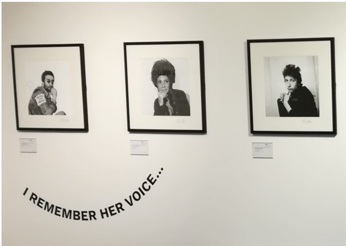
Installation photograph of He was a wild one at New Adelphi Exhibition Gallery.

Last chance to catch He was a wild one , an exhibition drawing together British music photography from the 1950s and 1960s, from the Open Eye Gallery archive in Liverpool