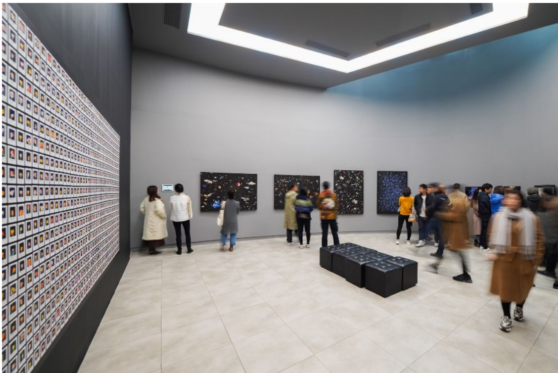
Peer to Peer opening at Shanghai Center of Photography.