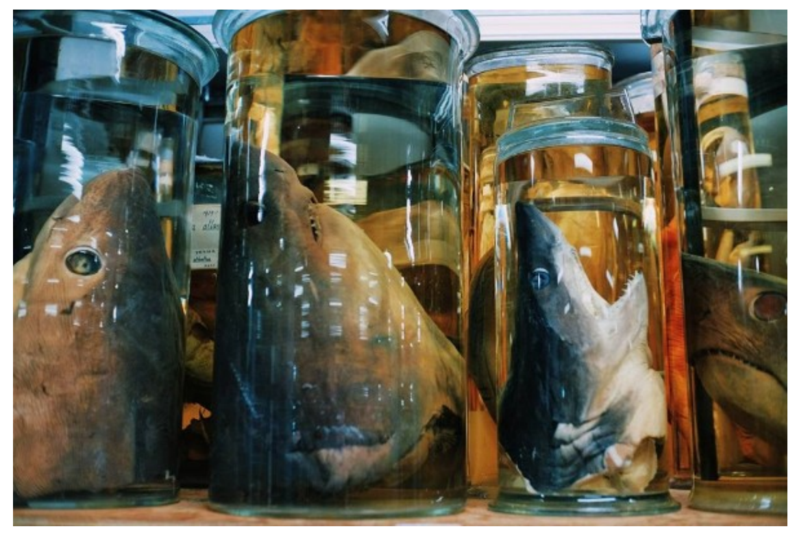
Shezad Dawood, Leviathan Cycle Episode 1, Ben , production still, 2017, HD Video, 13' 30".

Shezad Dawood: Leviathan, Episode 1: Ben