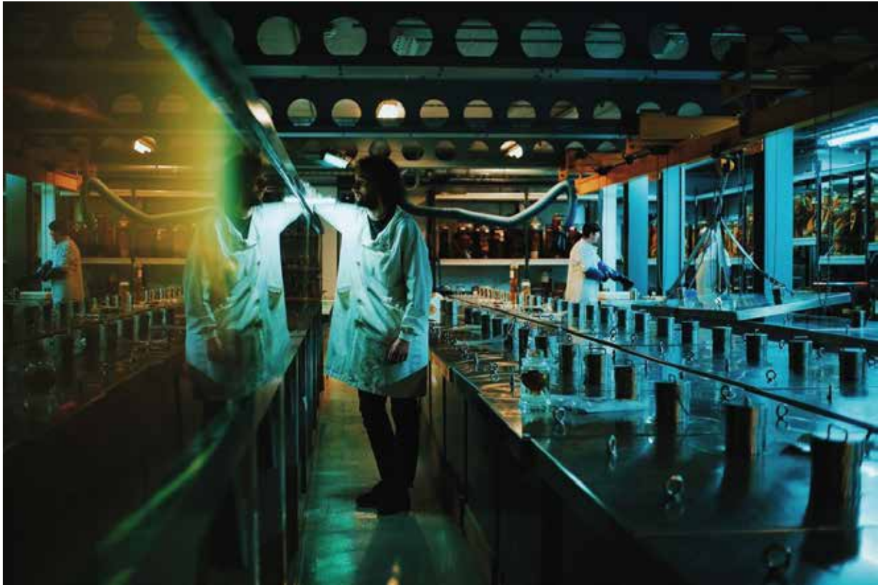
Shezad Dawood, Leviathan Cycle Episode 1: Ben (production still) (2017) HD Video, 13'30".